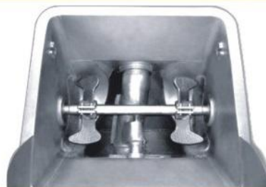
摆动及搅拌机构：采用动压双层密封及隔离漏浆设计。 Swing and mixing mechanism with double layer sealing and isolated leakage device.