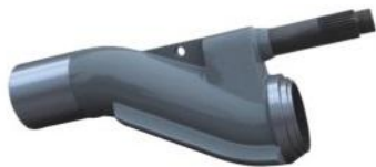
优化设计的S管 S-tube with optimized design