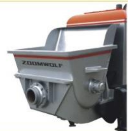
三维几何优化料斗 3D-geometry optimized designed hopper.